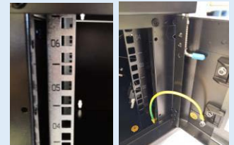
Zinc plated mounting profile with U mark (Ground wire optional)