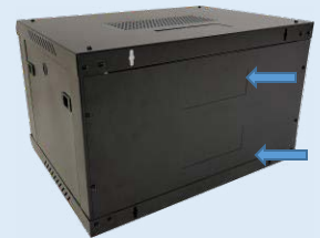
Cable entrance on rear panel