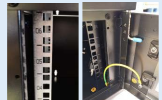
Zinc plated mounting profile with U mark (Ground wire optional)