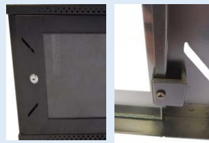
Front tempered glass door with metal perforated border