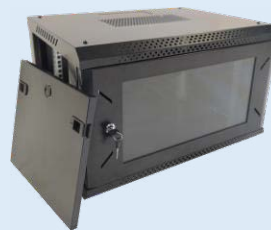
Removable side panels (Side lock optional)