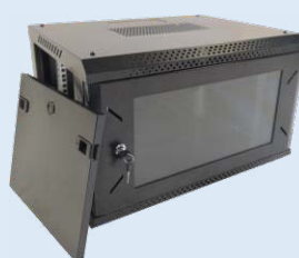
Removable side panels (Side lock optional)