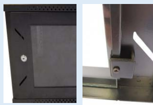
Front tempered glass door with metal perforated border