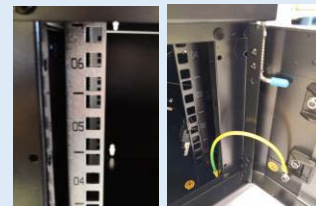
Zinc plated mounting profile with U mark (Ground wire optional)